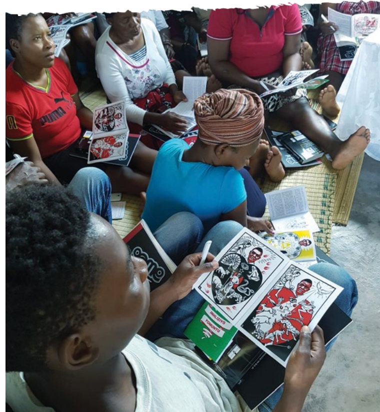
Thanks to faithful supporters like you, church members in the Mboza area were equipped to be disciple makers.

Your gifts will lead to change in rural Mboza. Where once was sadness there will be joy. Your gift will open the way to win souls for Jesus, make disciples and change the lives of hundreds of thousands. ✉