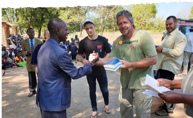
Thanks to faithful supporters like you, the team distributed 2 400 Bibles to believers in Malawi who were overjoyed and deeply grateful.